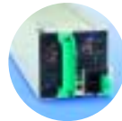
Intel® Power and Thermal Headroom

Intel® Power and Thermal Headroom provides sufficient power supply and thermal protection to maintain the performance levels essential for high-end I/O and graphics in current and next-generation servers and workstations. And the Intel® Validation Stress Test Suite ensures that the Server Board SE7525GP2 has passed some of the industry's most rigorous and extensive testing to optimize time-to-market, maximize data integrity, and minimize support costs.