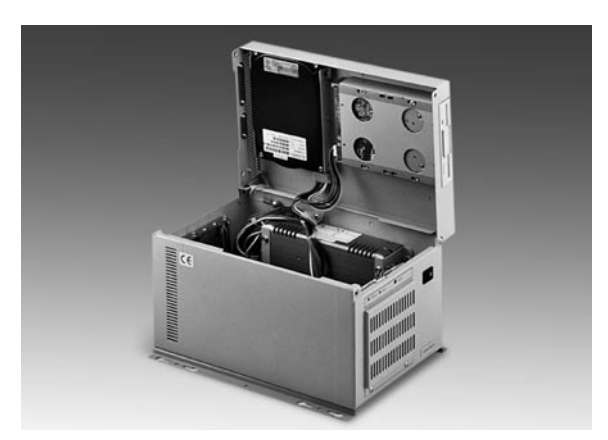
Easy access to internal components