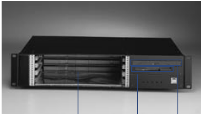
4-slot backplane with H.110 CT bus One slim FDD One slim CD-ROM