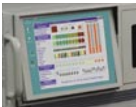
Adjustable view angle, monitor can be tilted for best viewing angle

The MPC-6050A 5U height 14-slot IPC chassis design that is very flexible. Included is a 10.4" LCD module and can keyboard/touch pad draw in a 5U height chassis. The LCD module can adjustable panel view and the keyboard/touch pad drawer is designed to be removed easily.