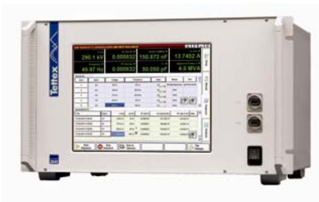
2820a & 2840 C / tanδ bridges