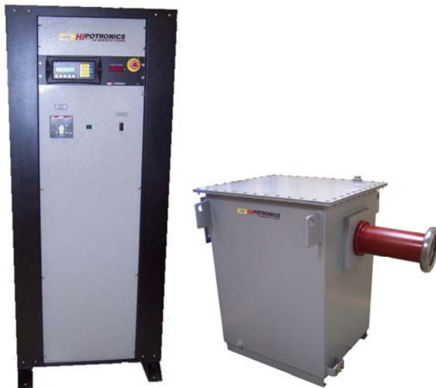
Standard System Controller

Hipotronics AC Dielectric Test Sets are available in a wide range of voltage and power ratings with exceptional reliability, durability and functionality. No matter what your requirement, Hipotronics has an affordably priced, highly reliable test solution to meet your needs.