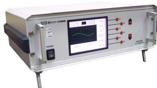
DDX Series Partial Discharge Detectors