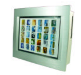
Cable-Less Design for best Vibration & Shock resistant