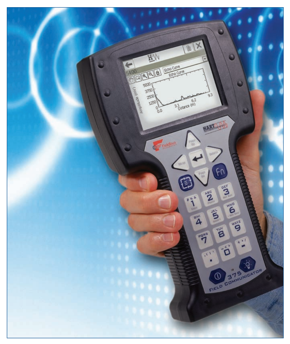
The 375 Field Communicator is designed to support all HART and FOUNDATION fieldbus devices from all vendors.