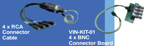
4 x RCA Connector Cable