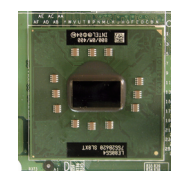
ULV Intel® Celeron M 600MHz 512K Cache/ 1GHz Zero Cache