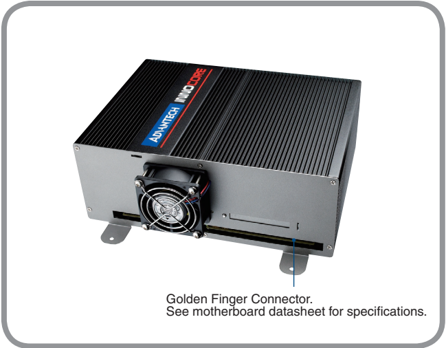
Golden Finger Connector. See motherboard datasheet for specifications.