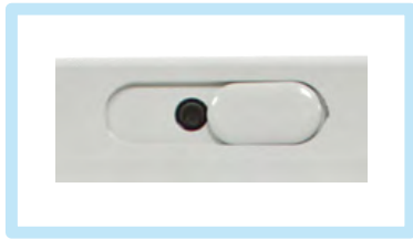
5.0MP CCD Camera with Privacy Slide