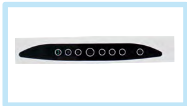
Capacitive Function Key