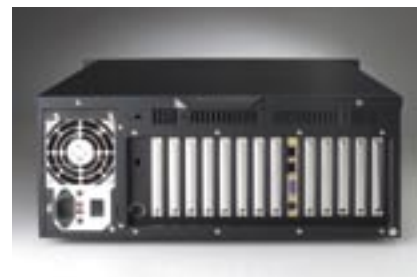
Rear panel of backplane version