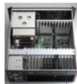
Hold-down clamp Max. 14-slot backplane