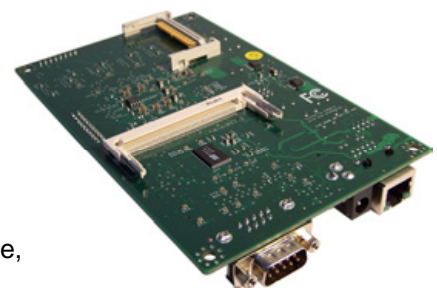
Mini PCI and compact flash card slot for flexible solutions