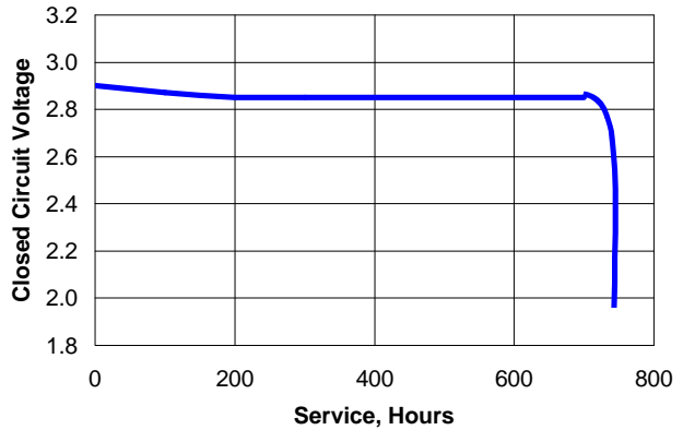
Simulated Application Test Estimated Average Service at 21°C (70°F)