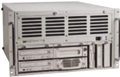
RACK-3030W With 4 x 5.25" Drive Bay