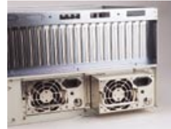
ARH-6400F 400W ATX Redundant Power Supply