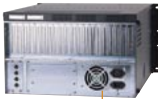
400W AT/ATX Power Supply