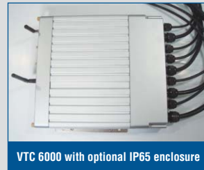
VTC 6000 with optional IP65 enclosure