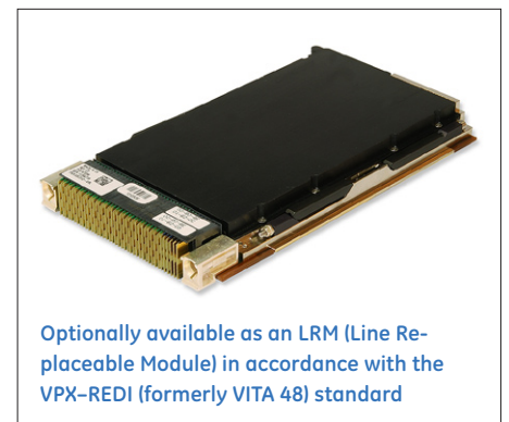
Optionally available as an LRM (Line Replaceable Module) in accordance with the VPX-REDI (formerly VITA 48) standard

The GRA111 is a form, fit and function replacement for the GRA110 which will fit the existing MAGIC1 Rugged Display Computer, providing a fast-to-market solution for small high-performance graphics and GPGPU signal processing applications.