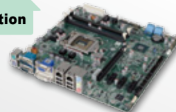
Small size board by IMB-H610