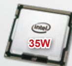
2nd Gen. Core i5/i3 CPU