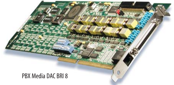
PBX Media DAC BRI 8